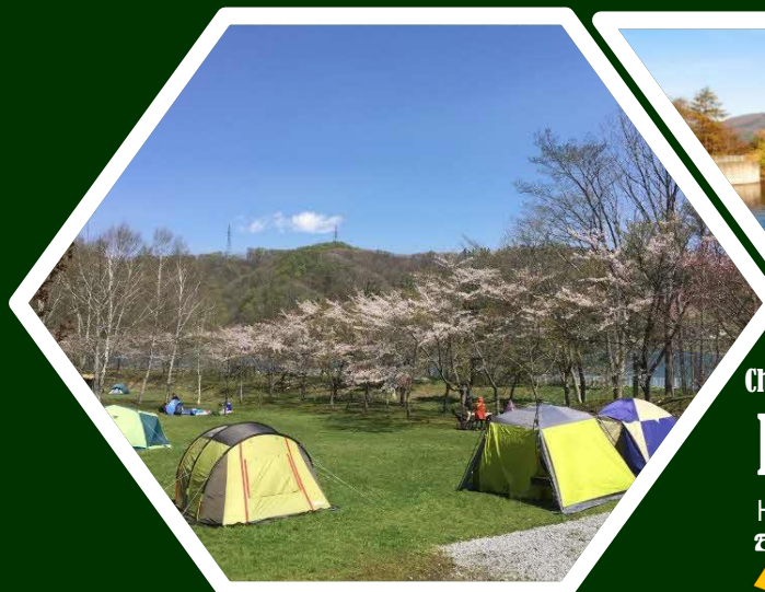
Cherry blossoms can also be viewed in spring