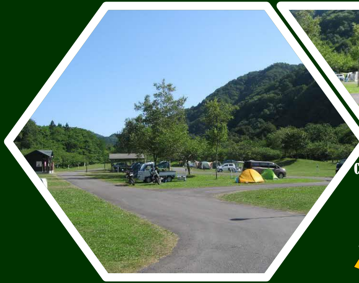
Campsite with abundant water and greenery