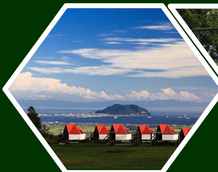
Panoramic view from the campsite